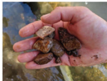
Photo 14 – Removed from bank indicative of pre-settlement floodplain conditions.