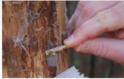
Scraping SLF egg masses from a tree.