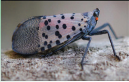
Adult, wings closed (Actual size = 1 inch)