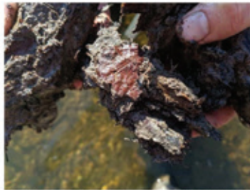
Photo 13 – Removed from bank indicative of pre-settlement floodplain conditions.

Historically, the Creek was dammed, which caused a large buildup of legacy sediment to settle upstream, this has greatly impacted the capacity of the stream, and now results in flooding. The banks are experiencing severe erosion at an aggressive rate, which is exacerbating negative impacts on the wildlife habitat. This erosion will continue to happen if efforts are not taken to mitigate these