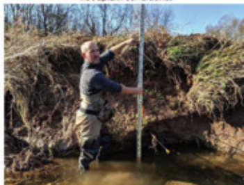
Photo 15 – Aggressive erosion on left bank causing bank pins to drop into channel.