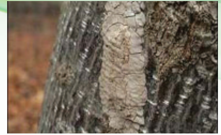
Egg Mass. Found September-June.

reduce the number of nymph or adult SLF you see later in the year.