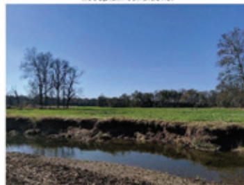
Photo 16 – Extreme erosion on concave bank upstream of Brills Run confluence.

issues. The proposed Conewago Creek Floodplain Restoration is intended to restore the site to conditions that are as close as possible to pre-settlement era conditions. Restoring the Creek will have immense benefits including improved downstream water supplies, improved recreation in Londonderry Township, reduced flood potential, and reduced sediment and nutrient pollution.